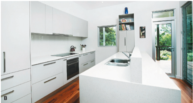
A The front of the house has had a synthetic texture applied to the existing render B The streamlined kitchen

Positioning the kitchen within easy access to the deck allows the cook to chat with guests while preparing food