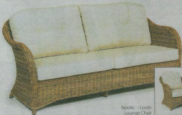
Nordic - Loom Lounge Chair