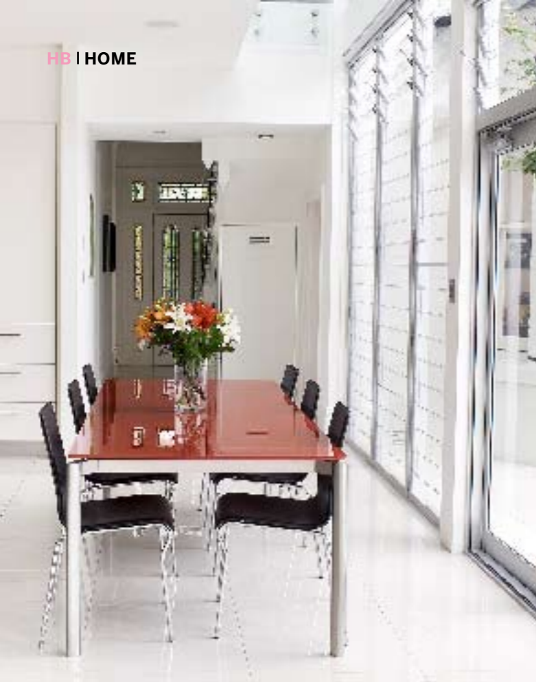
The uncluttered feel of the home connects the modern dining area (above) to the more traditional style of the lounge room (right). The rich chocolate tones of the sofa, armchairs and coffee table, all from Fanuli Furniture, contrast with the creamy walls painted with Porter's Paint in Icelandic Stone. Colour is added with a painting by Georges Doussot and cushions from Papaya.