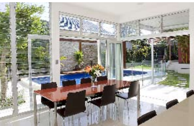
The open-plan kitchen/dining area has a modern and slightly industrial feel. Top of the range Miele (top) appliances have been positioned together for a neat finish, while a barbecue hotplate is mounted flush in the kitchen island bench. The gorgeous red glass table (above) from Fanuli Furniture is a true statement piece. The same colour, Porter's Paints Pomodoro Stone Wash, has been used on the outside laundry and garage (right).